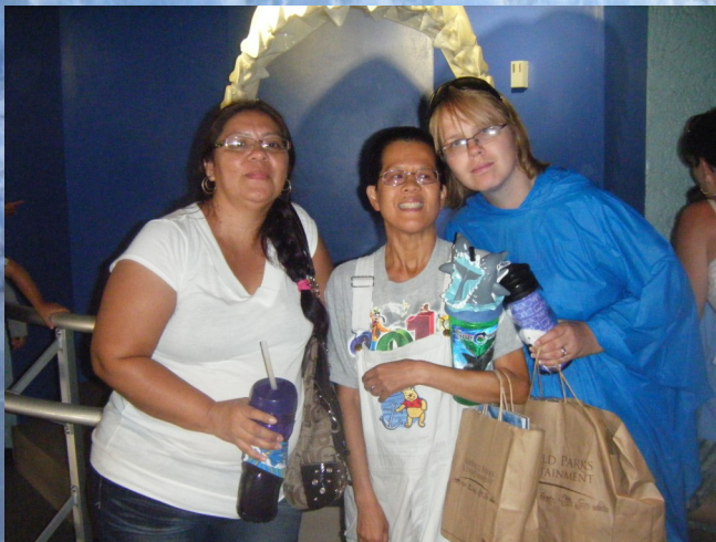
Below, right: If their smiling faces are any indication the ladies had a great time in Southern California.