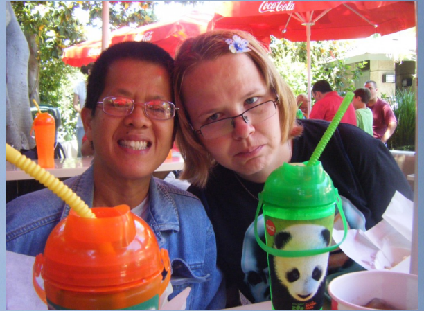
Above: Pausing at the San Diego Zoo for a little refreshment.