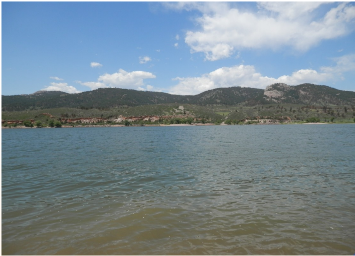
Above: the lake at Horse Tooth Reservoir in Northern Colorado provides great outdoor recreation space for clients and staff.