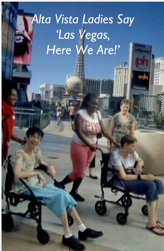
Alta Vista Ladies Say 'Las Vegas, Here We Are!'